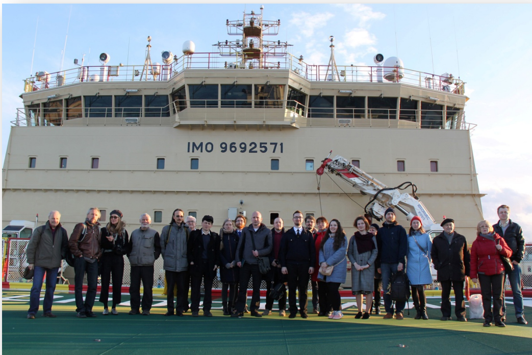
A picture to remember: the participants of "Polar readings 2018" on the helipad of the icebreaker Novorossiysk